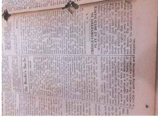
March 15, 1924 That Flaming Cross. C.A.T.

I am going to send these letters to the editor in groups rather than in one email. Some are not easy to read. It will be good to have them in your digital box file. Sherrill