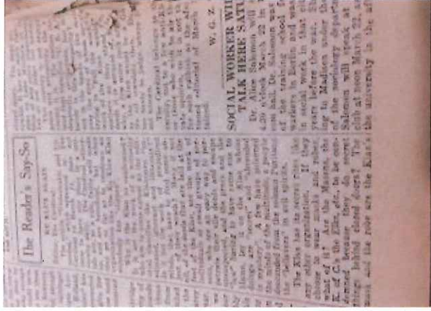
March 18, 1924 Ku Klux Again W.G.Z