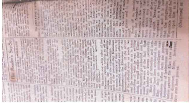
March 19, 1924 Native Americans